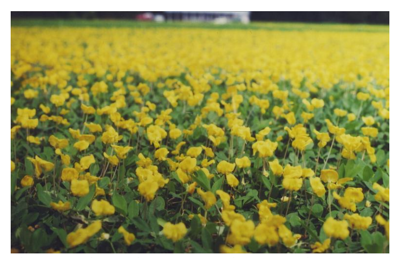
Figure 3. Heavily Flowering Rhizoma Perennial Peanut in a Lawn Environment

Much of the data related to Ecoturf has been observational and where other data is available it is primarily DM yield data. Some color and appearance ratings figures were reported by French et al. (2001, revised 2006), and these will be included. This PI is proposed for a germplasm release only to document the dual purpose ornamental and forage characteristics of the line.