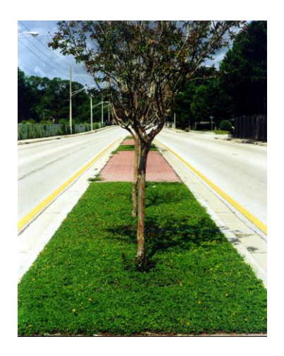
Figure 5. PI 262840 Perennial Peanut as a Groundcover in Highway Median

These findings suggests that PIs 262839 and 262840 are best suited as low growing ground cover selections that are best adapted to the lower Coastal plains and peninsular Florida. In frost free areas, they are likely to show superior growth and turf traits.