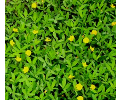
Figure 1. Florigraze Rhizoma Perennial Peanut.

field trials and was released jointly by the University of Florida and the USDA-SCS in 1978. To date, this cultivar dominates the acreage of perennial peanut planted in the southern USA.