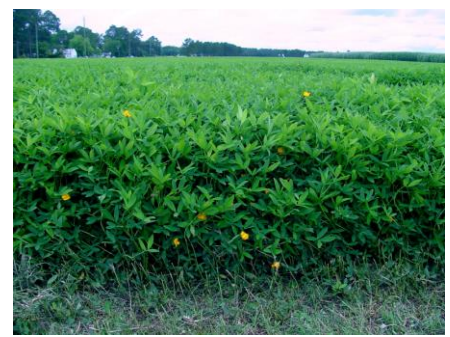
Figure 2. Arbrook Rhizoma Perennial Peanut.

The University of Florida and the USDA-SCS jointly released another plant introduction, 'Arbrook' (Figure 2; PI 262817) in 1985 (Prine et al., 1986a, 1990). Arbrook was a plant introduction from Paraguay that was first introduced into the USA in 1959. It had been noted as a superior accession of rhizoma peanut at the Arcadia and Brooksville Plant Materials Centers, and at the University of Florida. Normally, Arbrook has larger stems, leaves, stolons, and rhizomes and fewer flowers than Florigraze. It also has earlier spring growth, is less winter hardy and forage yields of Arbrook are often higher than that of Florigraze. Forage quality of both varieties is similar (Prine et al. 1986a). Its major limitations are that it is less tolerant of poor soil drainage and has winter-killed on heavy soils in northwest Florida and at Americus, GA (Prine et al., 1986a). In recent field trials at Marianna, FL, it has yielded well and has a longer seasonal growth pattern than the other varieties tested.