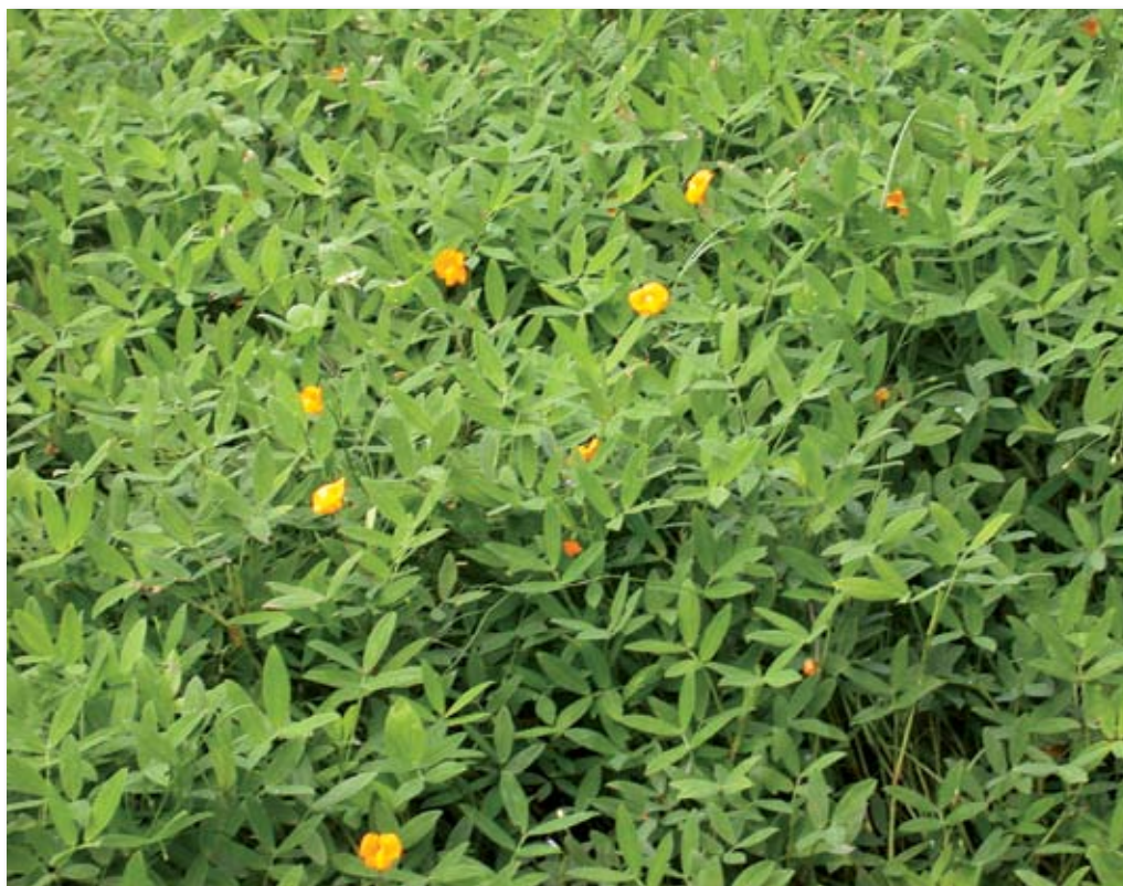
Perennial peanut is a true perennial legume, with the oldest known stands having persisted for more than 30 years. The growing area for this crop is limited to the Deep South.